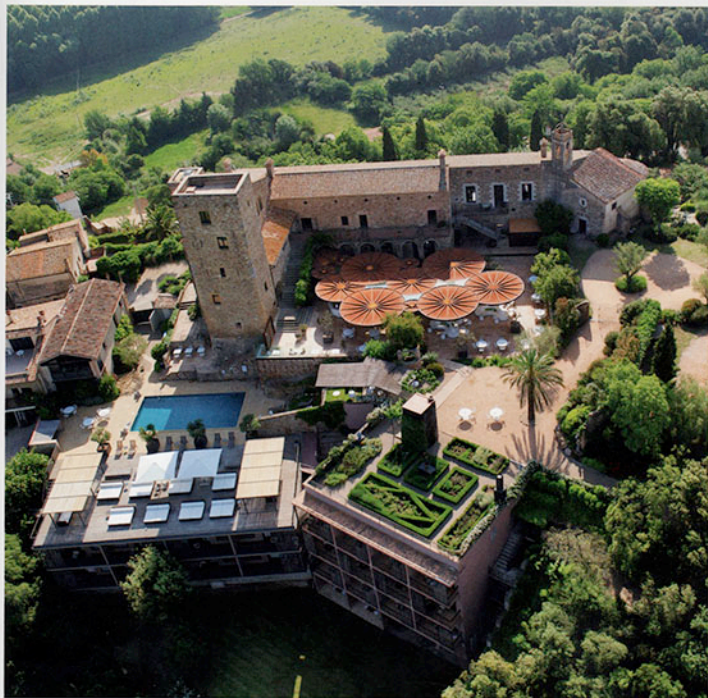
↑ | Floor plan, with roofs ← | Aerial view