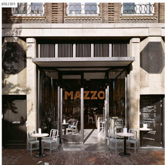
MAZZO Amsterdam Concrete Architectural Associates

Location: Amsterdam, the Netherlands Floor Area: 400 sqm Completion Year: 2010